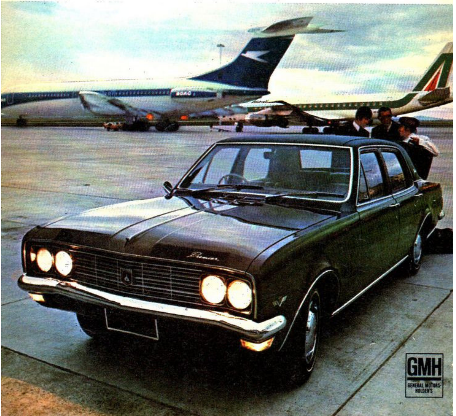
Holden Premier, 1970